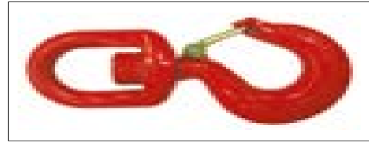
Safety: homologated self locking swivel hook